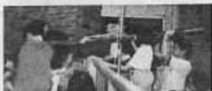
✦ Cheerful "Casualties"