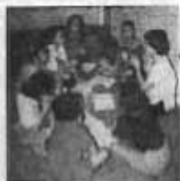
✦ Small Groups in Discussion ✦