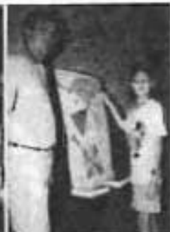
Wheel of Fortune