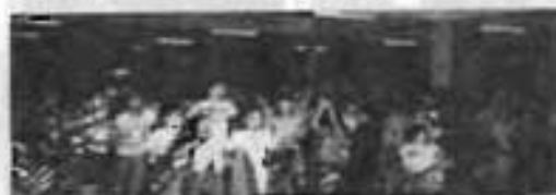
✦ Exuberant Audience at Prophets' Nite