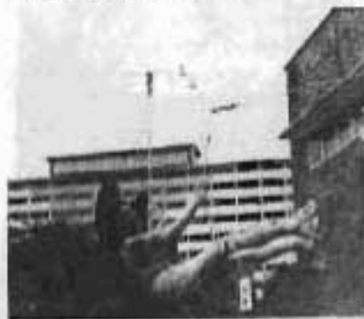
✦ Not for kids alone!

Praise God indeed for such a wonderful camp. I must also thank the teachers of K.I.D.S. Church for their hard work in organising the camp. Ω